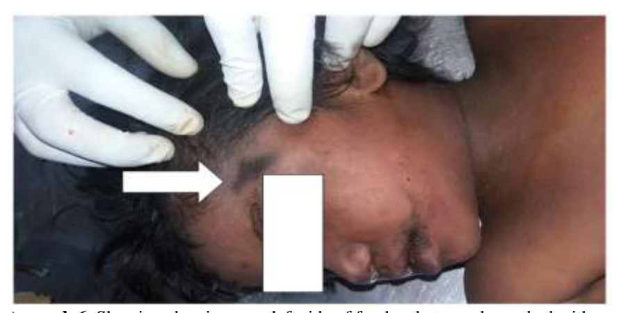
Photograph 6. Showing abrasion over left side of forehead at temple marked with arrow