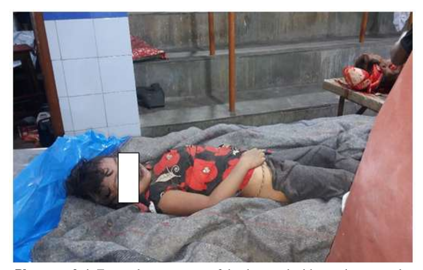
Photograph 1. External appearances of the deceased with wearing apparels