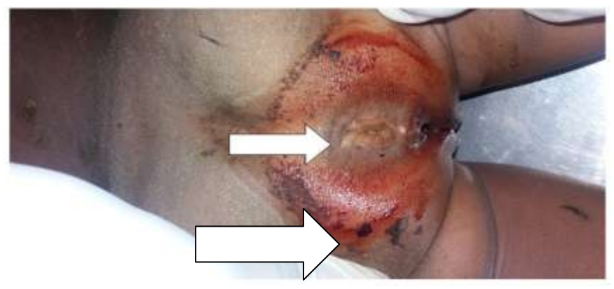
Photograph 8. Showing laceration of anal canal, Postmortem in nature, margins are not showing vital reaction marked with arrow (the local area stained with blood coming from vagina)