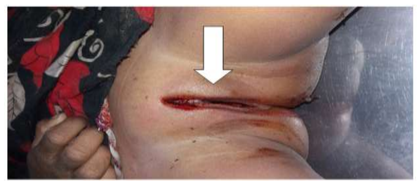
Photograph 3. Showing blood around external genitalia marked with arrow