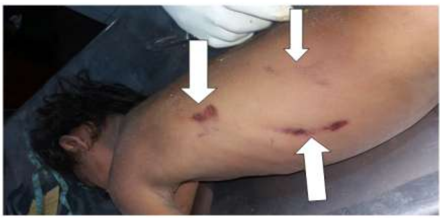
Photograph 7. Showing multiple abrasion over posterior and lateral aspect of chest and abdominal wall marked with arrow