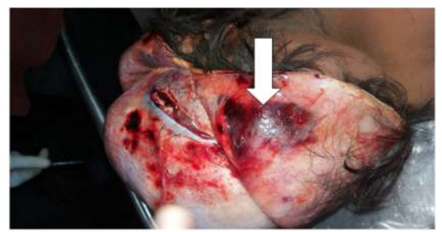
Photograph 11. Showing extravasation of blood into layers of scalp marked with arrow